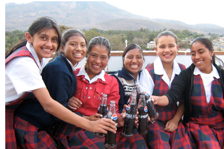
Girls from Marta & Maria celebrate a sewing and jewelry sale profiting over $5,000

Hijas is in the process of crafting a detailed business strategy and timeline in order to ensure the sustainability of the program. If successful, the sewing and jewelry program's profits will positively impact the day to day lives of the girls residing at Marta & Maria.