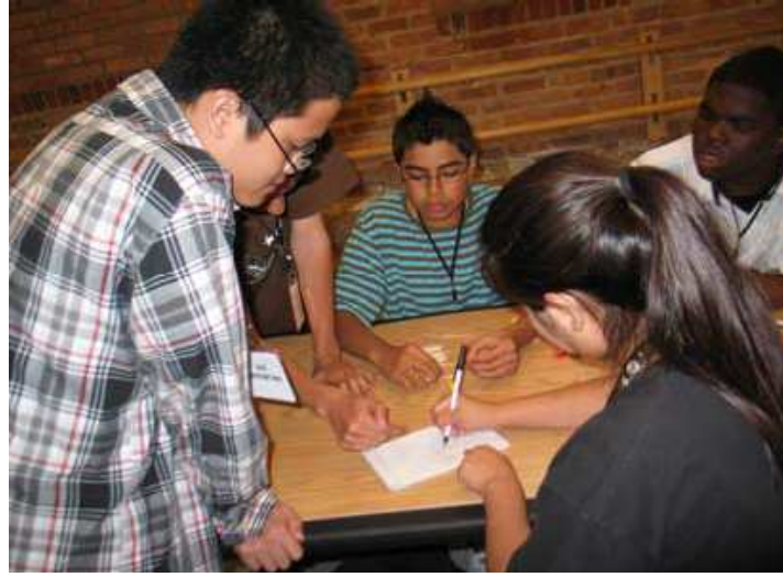
Students participate in a Language for Scholars workshop

Leap Learning Systems is a Chicago based organization that delivers language and literacy development programs to educators, students and their families across Chicago and beyond. Its efforts focus on those in underserved communities. Last year, the HEAR Foundation extended a grant to Leap Learning Systems thus initiating a relationship between the two organizations.