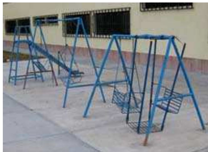
(Above) The old playground at Marta & Maria