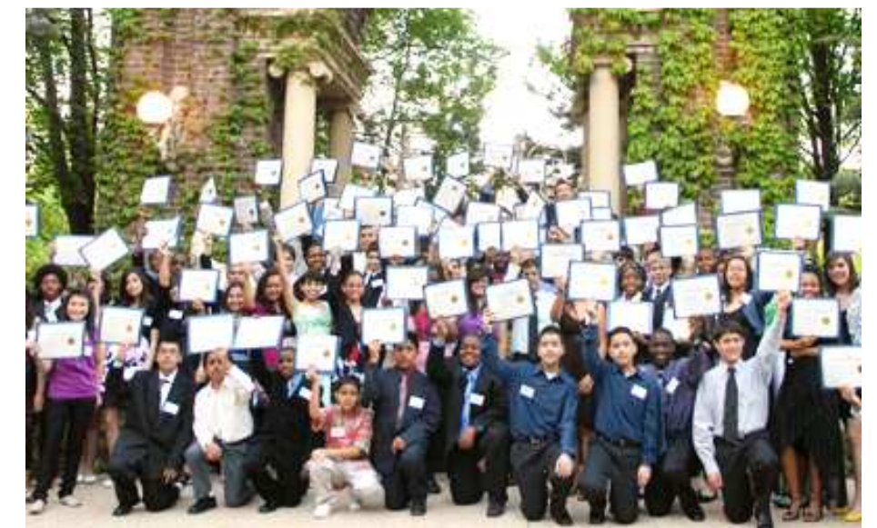
DMSF class of 2013 at its award ceremony in May

HEAR is in the process of building an endowment fund for the scholarship in order to establish a perpetual resource for students in need in the Chicago area. All proceeds from the HEAR Foundation Holiday Fundraiser will go towards this program. The scholarship application and all relevant information about the scholarship is posted on the HEAR website: www.hearfoundation.org