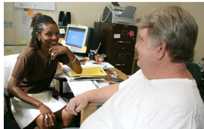
A North Side client talks with his case manager.

clients through this program, 32 of whom have been chronically homeless. 82% of these clients demonstrated residential stability by living in their homes for at least 13 months. Through the help of North Side, 82% of the supportive housing clients saw increased income due to employment or entitlement benefits. These individuals also utilize North Side's other services including the Health Care Case Management Program, the Intensive Case Management Program, the Pathways Employment Program, and mental health care services. In all, North Side provided 15,688 permanent housing nights in FY09.