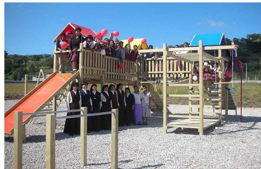
Residents of the Casa Hogar enjoy their brand new playground.

effective plumbing and septic system. HEAR has helped the Home arrange trash pick-up so that the home has a safer method for disposing of trash. They are also beginning to compost. Due to the amazing generosity of donors we have funds secured to proceed with planning and implementing a comprehensive nutrition program for the girls which includes: supplying meat as a protein source, providing education on how to prepare food (particularly meals with meat, which they rarely have an opportunity to use currently), providing pots, pans and other cooking materials, and installing an irrigation system for their crops so they may consume and sell them. HEAR is partnering with the Home and the community in order to ensure success of this program.