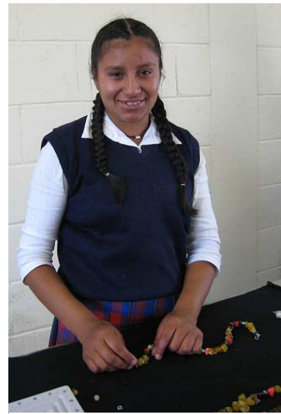
A resident of Casa Hogar who is a participant in the Hijas program inspects a necklace.

HEAR's grant allowed 34 youth from Chicago's inner-city to attend a summer camp in Wisconsin. The kids were very grateful and excited about the new experiences and environments they encountered. HEAR fully funded this program.