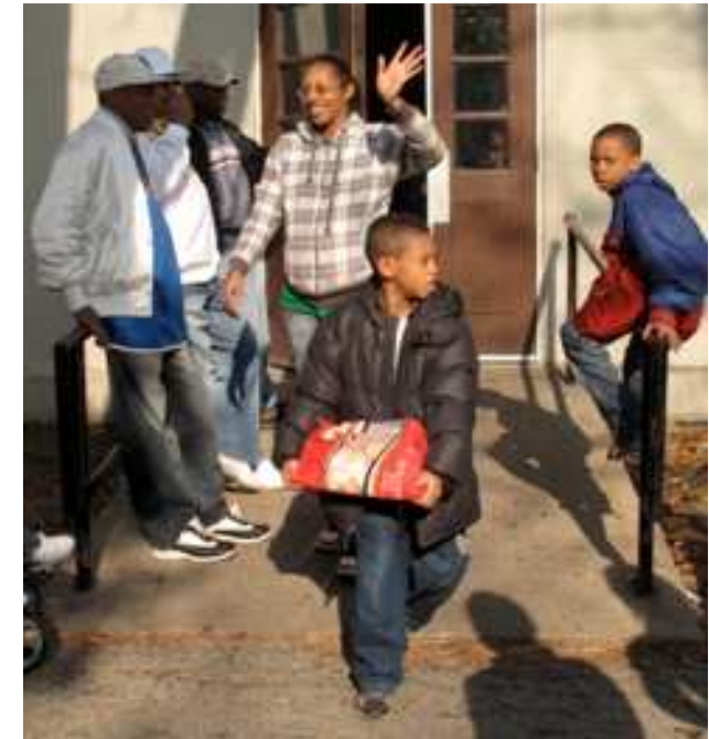
Families collect chicken in the Englewood neighborhood in Chicago.

In 2009, HEAR raised nearly $200,000 for the HEAR Scholarship endowment fund. The program